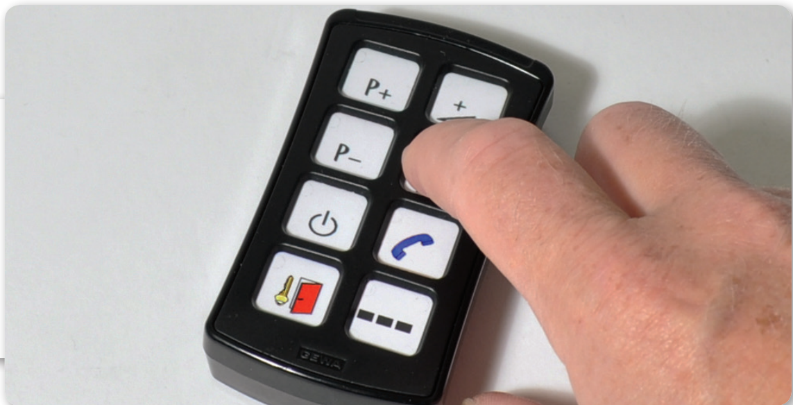
Gewa Control Medi

- A tiny IR transmitter with advanced features