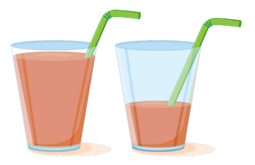
A lot or a little lemonade