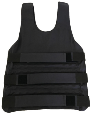
Somna Vest Balance