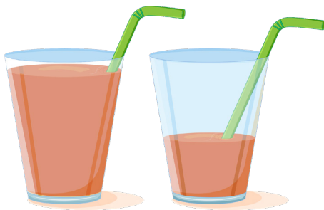
A lot or a little lemonade