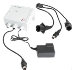
GEWA ANDROMEDA BED

With Andromeda Socket and an optional switch, you can easily control, for example, a household appliance, a battery toy or a lamp. Suitable for you who tremble on your hands, have reduced muscle strength or vision