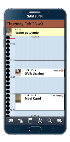
Example: Time pillar on Android