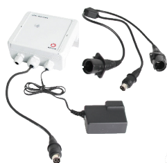
GEWA ANDROMEDA BED

With Andromeda Socket and an optional switch, you can easily control, for example, a household appliance, a battery toy or a lamp. Suitable for you who tremble on your hands, have reduced muscle strength or vision