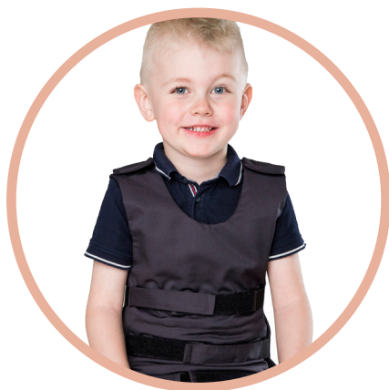
Somna Weighted Vest