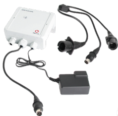
GEWA ANDROMEDA BED

With Andromeda Socket and an optional switch, you can easily control, for example, a household appliance, a battery toy or a lamp. Suitable for you who tremble on your hands, have reduced muscle strength or vision