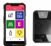
GEWA ONE ART NR. 461605