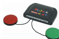
BIG JACK ART NR. 402500

Remote controls for those with major cognitive or motor disabilities. The unit can be controlled by using external switches. It can provide up to six functions independently controlled by six separate switches which could be labelled with pictures or text to indicate the appropriate function.