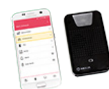
GEWA CONNECT ART NR. 461180

GEWA One is a remote control for people with cognitive disabilities. In order to keep in touch with your loved ones and quickly reach a support person, you have the opportunity to call and text with GEWA One. You choose whether you want to use the touch screen, or navigate around with an external control switch. Symbols, colors and voice recordings help you quickly find the right button.