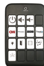
GEWA MAXI ART NR. 461130

Remote controls for direct access with a finger guide are comfortable to hold, and easy to use for people with cognitive or motor-skill impairments. Confirmation of a button being pressed occurs via vibration, sound and light. Pictures with symbols for the buttons can easily be created on Abilia's website.