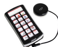
CONTROL PROG ART NR. 425700

Remote controls supplied with key guards make it easier to operate for people who have difficulty pressing buttons. It is easy to change over to scanning with an external switch. Individual overlays with clear symbols can be easily created on Abilia's website.